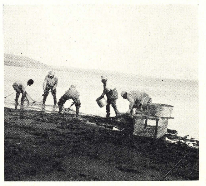
Fish and Game Commission personnel conducted seining operations at Kanopolis reservoir throughout much of the summer months to remove overabundant carp and small channel catfish found in that impoundment. The channel catfish were planted in other state and county lakes open to public fishing as a part of the Commission's fisheries improvement program.

"Howls that there isn't enough game or fish and then gives out with anguished cries when the cost