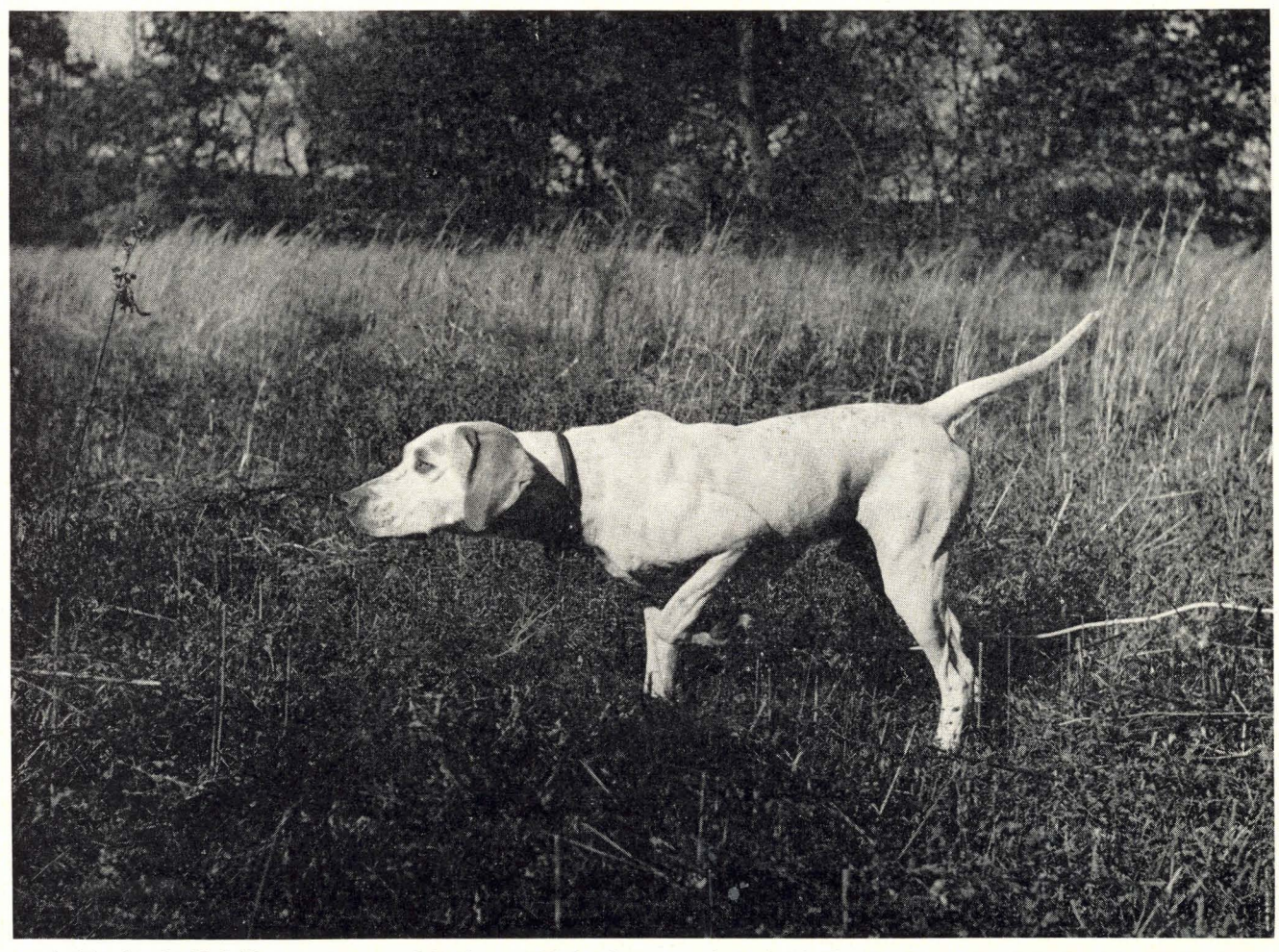
A sight that should thrill any sportsman and dog lover. This fine dog, on perfect point, is Sleet Break, owned and developed by Bill Clark, Clark's Kennels, Independence, Kan.

Answer: No. There is a very logical explanation to the cause for small birds being taken during hunting season. Due to a number of factors, initial attempts to nest are unsuccessful. Quail often hatch clutches as late as August or even September. Therefore, when the hunting season rolls around in November these young quail from late hatches have not attained full size. Hunters often make the faulty assumption that the birds are the result of inbreeding.