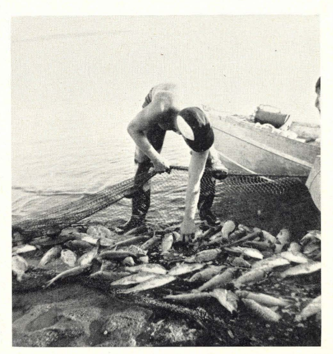
Some of the carp that were removed from Kanopolis Reservoir during the summer in seining operations conducted by Fish and Game Commission personnel. Over 10,000 pounds of carp were netted, cut up and thrown back in the lake to provide food for other fish in the reservoir.

Gun Shot Wounds: If the wound is deep, the best first aid treatment is to keep the dog in a quiet spot while a veterinarian is summoned. Hemorrhaging may be controlled by means of a tourniquet or other pressure between the wound and the heart. If a limb is broken, make a splint from a piece of board or a stick, pad the limb, and tape the splint in place. Carry