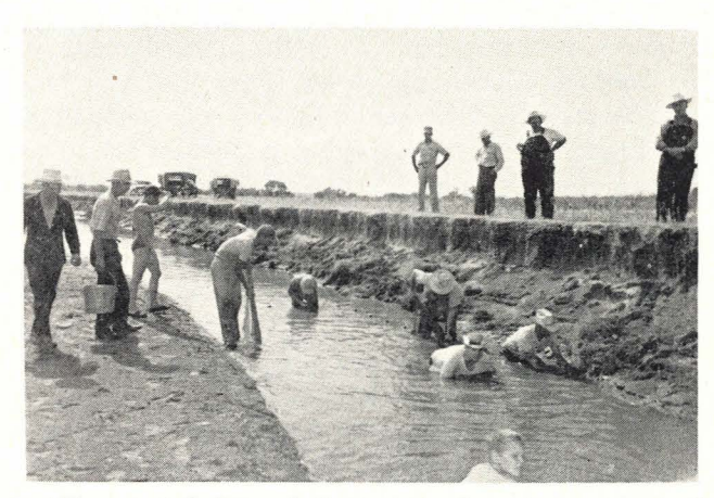
This was a typical scene in Kansas during the past summer as drouth conditions dried up many streams, lakes and ponds. Here sportsmen and landowners are helping fish and game personnel in salvaging fish from a low stream near Kiowa. The Kansas Fish and Game Commission gratefully acknowledges the help of sportsmen and farmers in rescuing thousands of fish during the summer. Without this help, the loss of fishlife would have been much greater.

There are a lot of facts about nature that many folks do not know. We just learned over the radio how skunks don't like the smell of moth balls. A lady up in Wisconsin had a family of skunks living under her front porch. She put moth balls around and they left. We never heard of this before, but we heard of a fellow putting a moth ball in a teabag when he fixed tea for his mother-in-law and she cut her visit short.— Monticello Express, Iowa Conservation Bulletin.