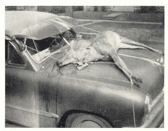
Mortality on Kansas highways is not confined to human beings. Here is a deer that was killed by an automobile on the highway near Topeka. Fortunately, the State Game Protector was notified in time to butcher the animal before the meat had spoiled. The meat was given to the St. Vincent Orphanage in Topeka.

"The stories they tell are almost identical—a calf